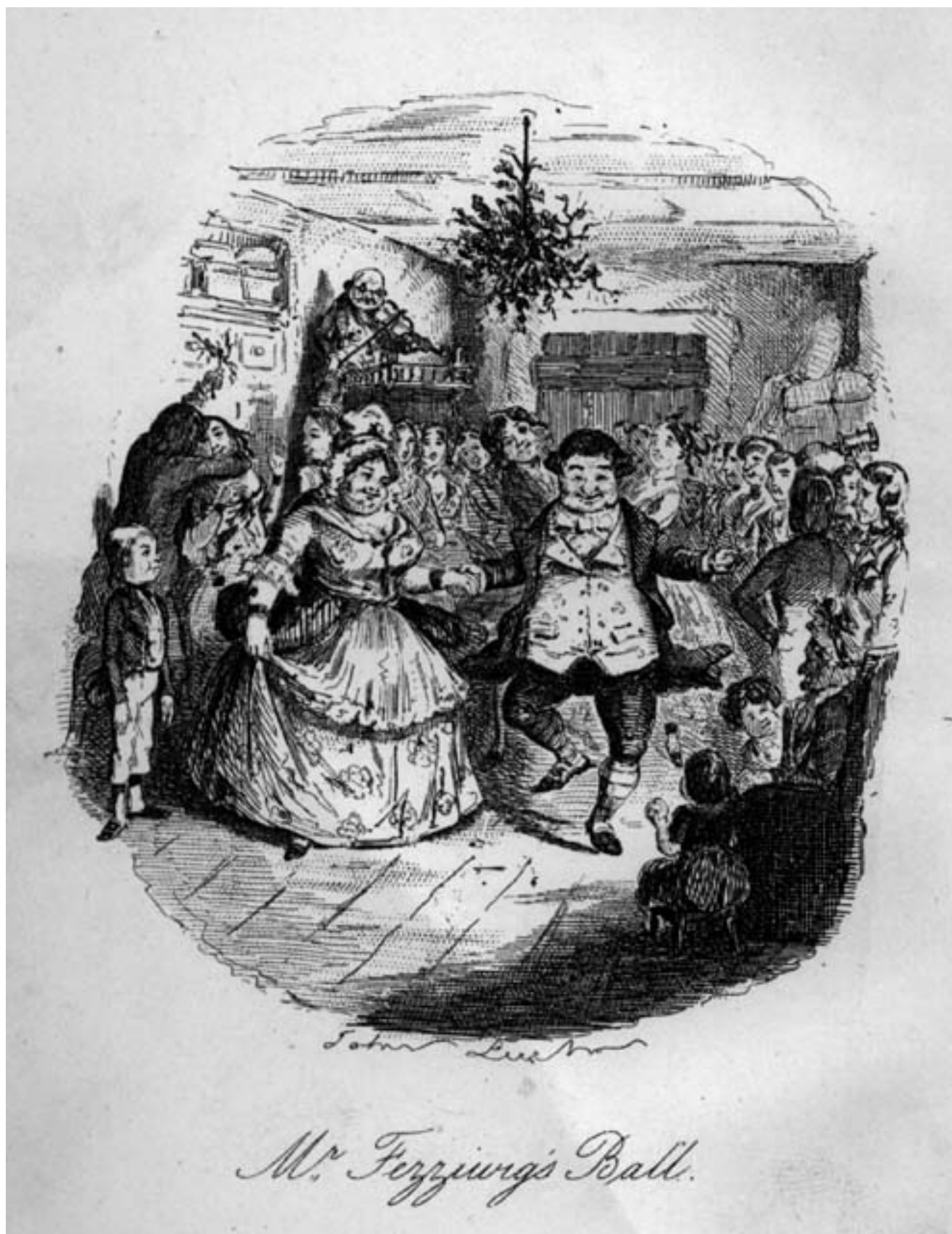
Figure 3: Mr Fezziwig's Ball : illustration by George Cruikshank from Dickens' A Christmas Carol (1843)