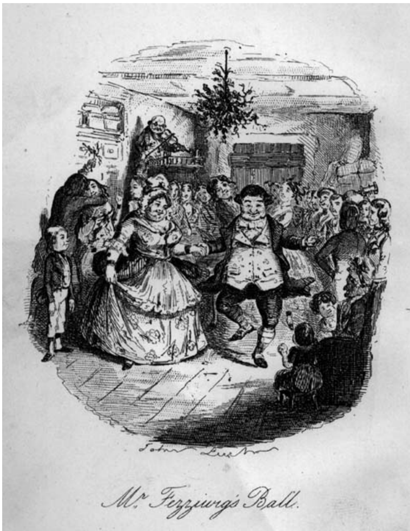
Figure 3: Mr Fezziwig's Ball : illustration by George Cruikshank from Dickens' A Christmas Carol (1843)